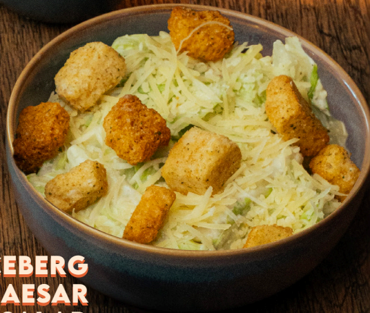
ICEBERG CAESAR SALAD