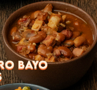
CHARRO BAYO BEANS